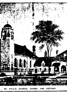
ST. PAUL'S CHURCH, CHAPEL AND RECTORY

from from the rear of the east side of the church, is also joined to the rear of the rectory, comprising a section of three bays.