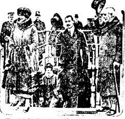
The arrival of the King and Queen of Denmark, accompanied by the Princess Margrethe, on the British coast of England, on the occasion of their first visit to the United Kingdom. The King and Queen are shown in a scene from their visit to the United Kingdom.