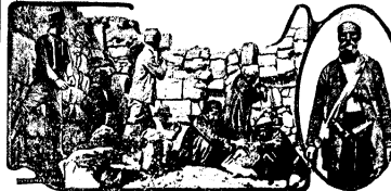
Armenian volunteers in uniform are being recruited in Aintab, in the mountains of Cilicia, to defend the city against the Turkish nationalists. At the right is a Turkish soldier, who was killed in the city of Aintab, which was captured by the Armenian volunteers.