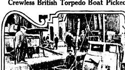
The French cruiser Vauquelin arrived at Plymouth, England, with the British torpedo boat O-19 in tow.

The French cruiser Vauquelin arrived at Plymouth, England, with the British torpedo boat O-19 in tow... Crewless British Torpedo Boat Picked Up in Channel.