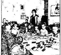
Nationalized children sitting in a hall at a school in Moscow, where all children become the property of the state upon reaching a certain age.