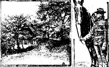
The picturesque Slavonic town of Prague, Bohemia, threatened by the German and Hungarian forces, shows here at last some relief.