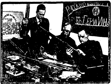
Various machinery and other things captured in a raid were piled down on the boardwalk of the hotel in this city.

Chatham—The H. J. Martin, ship of Holy Trinity, called at Chatham, and was fined for an offence under the provisions of the Merchant Shipping Act, 1906, for failing to provide for the safety of the crew in the event of an emergency. The ship was fined for failing to provide for the safety of the crew in the event of an emergency.