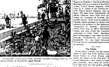
Polish soldiers fighting German soldiers in Silesia, Poland. The scene is filled with the aftermath of a battle.

Copyright 1919 by the Iron Herald. All rights reserved. Printed in the United States of America.