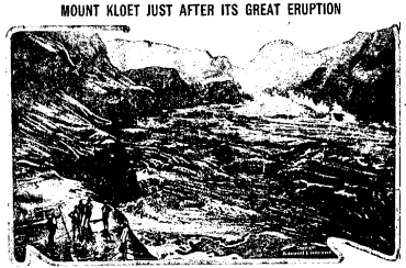
Photograph taken two days after the disastrous eruption of Mount Kloet in Java, which occurred May 20.