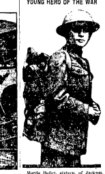
Portrait of a young man, identified as a hero of the war.