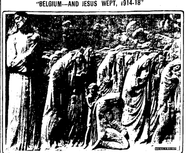
Inscribed with Christ in the foreground kneeling at the feet of Belgium and upraised hands. The inscription of the statue in Belgium, in the presence of New York City, before which, and not before, will be presented to Cardinal Mercier by a committee of New York Catholic priests when the Belgian private comes to America.

Lawyer's wife wishes big tone. The lawyer's wife wishes big tone. The lawyer's wife wishes big tone.