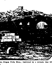
View of houses blown down in Fergus Falls, Minn., devastated by a tornado that killed several hundred persons and wrecked much of the town.