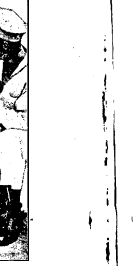
His one ambition... His one ambition... The man has one ambition...