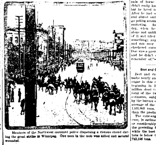
Members of the North-west mounted police (showing a mounted constable) riding the great streets in Winnipeg. One man in the row was killed last week.