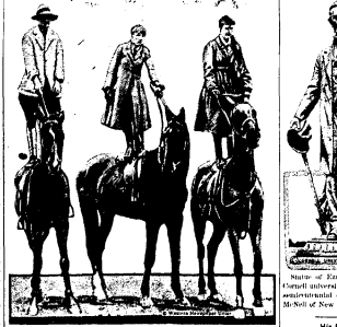
The photograph shows some of the expert lady riders of International Equestrian School of England, London, England. During the war, International Equestrian School was the only school in the world to have the government and the best British hunters and polo players.