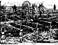
Graves of American aviators at Clermont, France, that were devoted to American soldiers.