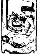
This is the first photograph taken of the President's new grandson, who is the son of the President's daughter.