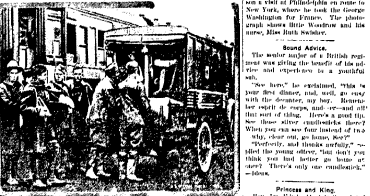
Yankee heroes embarking for home. The soldiers are being transported back to the United States after their service in France.