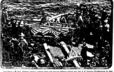
President and Mrs. Wilson, coming ashore from the cutter Olympia which met the S. S. George Washington in Boston harbor.