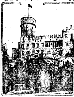
Old Castle in Trent.

By LLOYD ALLEN, Special Staff Correspondent. ...of the Upper Valley of the Ohio, but now he is being confined to the jail for having refused to testify against the man who betrayed the nation for $100,000. The man who betrayed the nation for $100,000 is now being confined to the jail for having refused to testify against the man who betrayed the nation for $100,000.