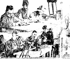
At the Waller Hotel in Washington, D.C., soldiers are learning to use their hands in a variety of occupations. These soldiers were formerly in the trenches.