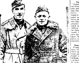
Two of the pilots of the twelve Hun planes, who were shot down by the American forces.