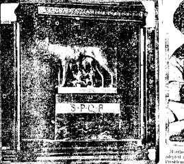
The beautiful piece of art work, depicting the entrance of Augustus and Bertha to the city of Rome in B.C. 27.