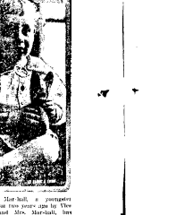
Happy Harrison Marshall, a man in a military uniform, is shown in a portrait.