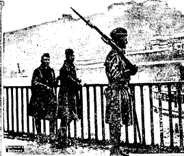
A tank company of the American Third division, after its occupation in Germany, on guard in Cologne.