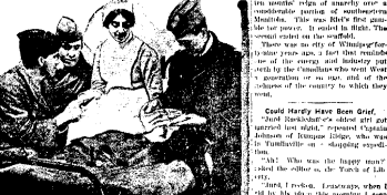
News items and souvenirs are being shown to the men of the British Expeditionary Force. The men are sitting around a table, and one of them is pointing at a document. The items include newspapers and other mementos from the front.