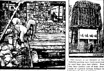
Already much of the northern province of France has been put on its feet. The picture shows the progress of the reconstruction of a town destroyed by the Germans. The men are working on the foundations of a new building.