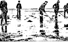
Major Beets Needed to Harvest This Crop.

(Special Information Service, Using Bureau Department of Agriculture.) OYSTERS NOW IN SEASON—GOOD MEAT SUBSTITUTE.