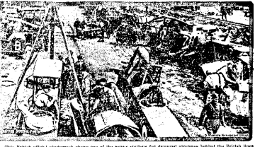
The British official photograph shows one of the repair stations for damaged airplanes behind the British lines. The building is a large, multi-story structure with several windows.