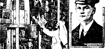
The hero of Zeebrugge attack, a man in a military uniform. He is wearing a cap and looking directly at the camera.