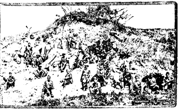
Yanks resting after the St. Mihiel victory. The soldiers are seen in the foreground, and the background shows the landscape of the battlefield.