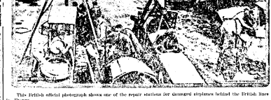
This British military photograph shows one of the repair stations at Langley airport behind the British front lines.

Yuan Shih-kai, the new president of China, has been elected by the National Assembly. He is a prominent Chinese politician and military leader.