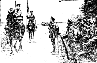
The hundred and thirty members of the 10th Foreign Legion of France are here to aid the Liberty Lion campaign. They were sent under the protection of the British consular, which will direct the lion of the plumes in the campaign which they are to aid.