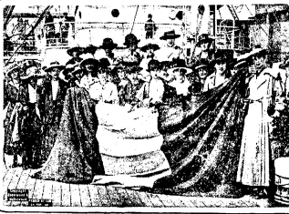
Sixteen-year-old French girls have arrived in America, the first of a group of 240 women who are studying at American universities. They are to study in American colleges, and after that they may return to France with American educational benefits and credits from these American girls' own parents.