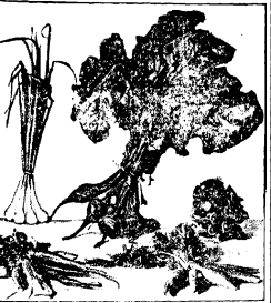
Some of the Good Things From the Garden.

Official Information Service, United States Department of Agriculture. MAKING THE MOST OF VEGETABLES.