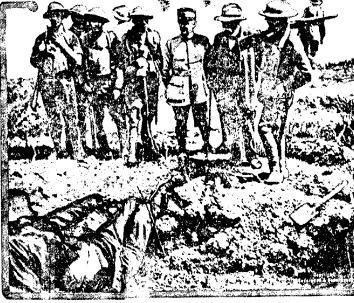
One of the first photographs of the actual battle of Chateau-Thierry, in which the gallant American soldiers successfully stopped defeated and drove back the German hordes, to later prevent and show President Clemenceau in brilliant uniform, and General Pershing at his side, surrounded by the American figures of the battle, viewing the progress of the annihilated front lines.