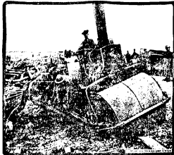
The engineers across the water were constantly busy making roads and reconstructing those that have been torn up by shells. There is a river that has cut across in a place, and it takes hours to cross the line from one part to the other.