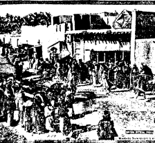
The number of injured, which after this time was increased from 100 to 150, was due to the fact that the engine was not equipped with a fire extinguisher.