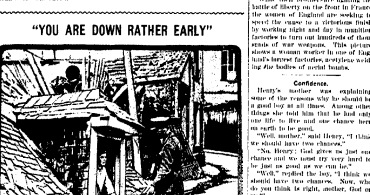
War on children. "You are down rather early." War on children. "You are down rather early."