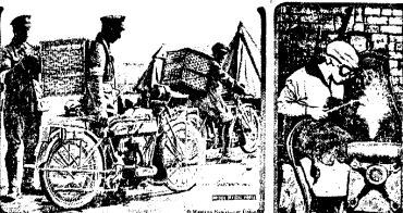
Training for war. Hopi's pigeons going to the front. Training for war. Hopi's pigeons going to the front.