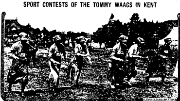
The Tommy Wags and women tennis players in Kent. Sport contests of the Tommy Wags in Kent.