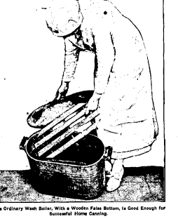
The Ordinary Wash Water, With a Wooden Face, Broom, is Good Enough For Successful Home Canning.

Official Information Bureau, United States Department of Agriculture. CAN—ALL WHO CAN CAN!