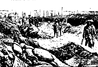
Tommy marching down a shell-swept road

Tommy marching down a shell-swept road. Tommy marching down a shell-swept road. Tommy marching down a shell-swept road.