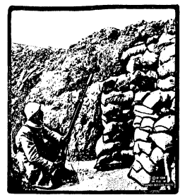
The Irish in the front here threaten "anywhere where the battle rages" needs to find a safe retreat into the ranks of the invading troops.