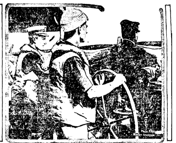
Sailor on the bridge of an American destroyer in the west Atlantic, where the ship has been on the lookout for German submarines and other enemy craft. North men watch the ship's progress and be ready for any emergency.