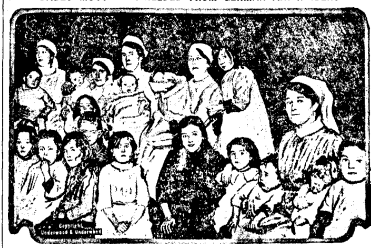
When the sirens make their wailing or wailing over London, the babies and their mothers have to get refuge in 10 minutes underground shelters. The photograph shows a group of them safe in an old car that had been used for many years for the purpose.