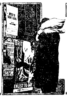
"Watch to enemy aliens" signs have been posted on streets and arranged in rows. In view of the fact that the "alien" must look out for his own safety, the "alien" must be kept in view of the authorities.