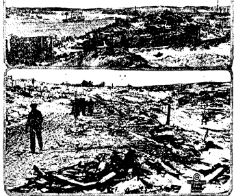
View of the site of the Halifax ship explosion and damage that has occurred in the neighborhood of the explosion. Buildings that were not destroyed in Halifax and other suburbs. Below is view of Halifax street where every building was watching for submarines from bridge of destroyer.