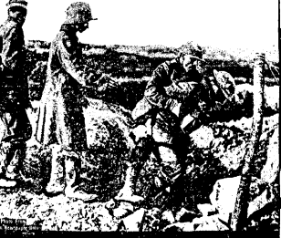
This characteristic scene from the front shows a comrade being helped in a wounded comrade back to the dressing station. Two German prisoners who had been captured, later after being captured.