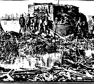
This military station "pill box" in a sandy, remote section of the front line, has been converted into a dressing station. These wounded men, lying close to the fighting line, are the result of their being kept in the pillboxes.