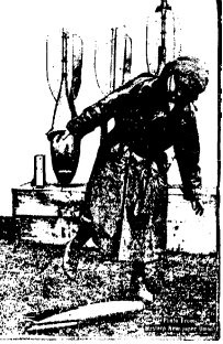
Several types of airplane bombs invented by Americans and adopted by the United States government are shown in this illustration. The same size and shape as the bombs shown in this illustration.