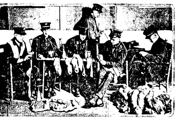
Knitting for the soldiers is a larger industry in the women. The women of...