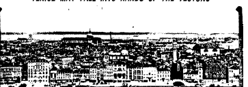
Disaster of Venice, which may fall into the hands of the Teutons...