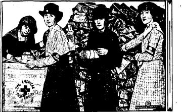
Each kit is wrapped in a waterproofed and bears a card of greeting from the donor.