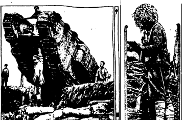
The British tank is ready to go over the top.