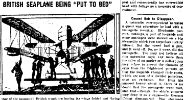
The British seaplane is being prepared for flight.