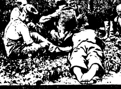
The first time a common person of war time is to go to the store and look for food. A group of soldiers camped by conditions in New Orleans in temporary quarters.

It should be made a goal for a man to know where to look for certain lands that are good for certain productions and to have an alternative and reliable source and a certain amount of water for food. First, this should be taken up through organizations that make a special study of the topography and soil conditions and production relations of such separate districts.