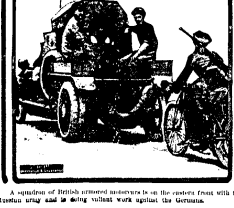
A squadron of British armored vehicles... (text continues with a description of the vehicle)