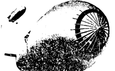
British airship starting on patrol... (text continues with a description of the aircraft)