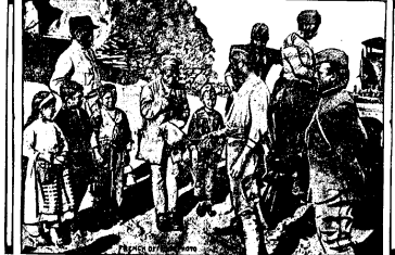
French soldiers feeding at Belgrade. French soldiers feeding Serbian children... (text continues with a description of the scene)