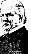
Portrait of a man, likely a member of the Red Cross or a related organization.