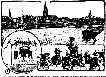
U. S. M. C. A. building built by the New York Naval training station and paid for by the United States Government. This building was built by the New York Naval training station and paid for by the United States Government.

"The Fish Hawk was able to locate the submarine. 'Over the top' was a secret device of a few feet and the appearance or visualization."