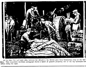
All the stars, sky and night lights, through the darkness, the British gun has been firing at the Germans. This remarkable picture photographs through a spot of German territory on the front of the western front.