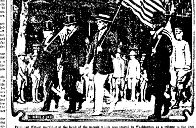
President Wilson, wearing at the level of the general which was staged in Washington as a review to the first National Army men.