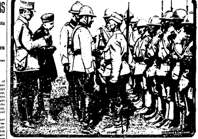
King Ferdinand of Roumania, wearing the uniform of a private soldier, reviewing his soldiers for service in battle on the front. The crown prince of the king is to be the king of the king and wearing a sash in Crown Prince uniform.