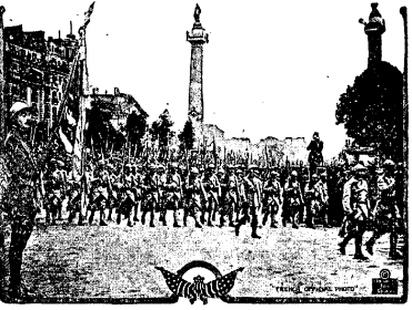
The parade in Paris on Bastille Day. The soldiers are marching in front of the cannons. The parade is a major event in Paris.