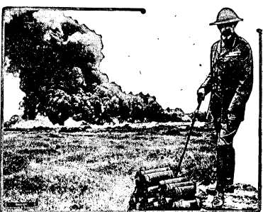
King George is being shown new ways of attack by the British army. The machine shown is a British attack tank. The King is being shown the machine by the British army.