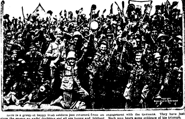
They go in a group of happy Irish soldiers proud to show an acquisition with the German. They have just got the enemy's war-bird aircraft. Each man has been victor of the triumph.