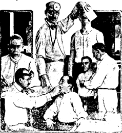
Review is made on show of the new recruits of the army at the White Plains, New York, training camp.