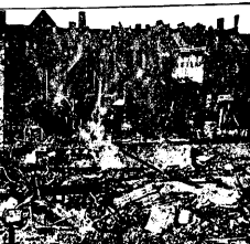
How in the negro quarter of East St. Louis, Ill., where about a hundred negroes were murdered during the riot, the scene was captured by the camera.