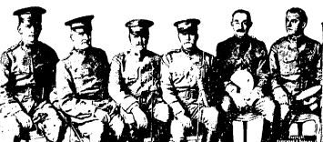
General Pershing and his staff in London. The picture was taken up until the marines had arrived safely on the other side.