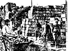
Leading prisoners of war in the Trossenau camp carrying material for the making of munitions near