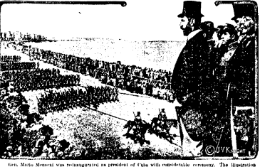
Mr. Menocal being inaugurated in Havana with traditional pomp. The photograph shows the inaugural parade on the Paseo Marti in Havana, and at the right, President Menocal and some of the dignitaries who were present.