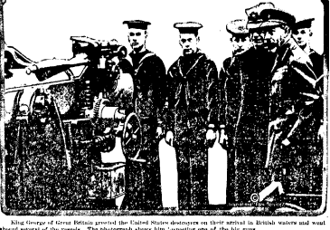
King George of Great Britain, greeted the United States destroyer on their arrival in British waters and went aboard several of the vessels. The photograph shows him inspecting one of the guns.

It is reported that we visited America in a motor lorry, and that we were taken to the front by the British army. We were taken to the front by the British army, and we were taken to the front by the British army.