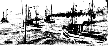
Home of the American destroyers that, according to official advice, already active in European waters taking an active part in the war on German submarines.