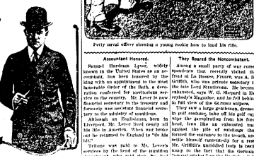
They heard the Noncomitant. Among a mass party of war non-combatants that recently visited the Red Cross headquarters in the United States, the heads of the Red Cross Council were present.