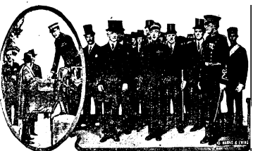
Members of the Italian War Commission in Washington. In the center is Prince Filippo of Udine, brother of the King of Italy.