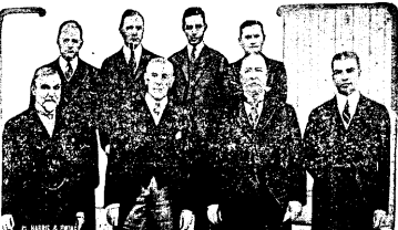
Photograph taken at the first meeting of the officers and newly appointed war council of the American Red Cross. Left to right: From left, William H. Taft, president; Woodrow Wilson, president of the War Council; William H. Taft, chairman of the War Council; and others.