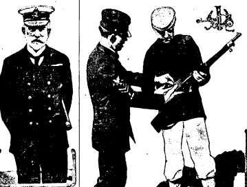
Admiral Hamilton in the use of the barbed wire of Great Britain naval gun.