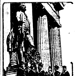
Union of French Jackies on whom have visiting the statue of George Washington...