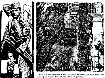
March of the members in the "Wake up, America" parade in New York entering the Big City Park of the United States Park.