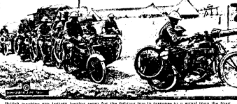
British machine gun battery taking cover for the night. It is prepared to equal them in the front.