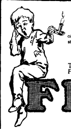
Time to Redress? (Buy Fik)