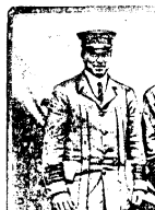
Members of the Serbian Army who were rescued from typhus in the Balkans.

Members of the Serbian Army who were rescued from typhus in the Balkans. The men are standing in a line, some wearing hats, and appear to be in a camp or a military installation.