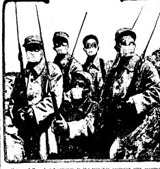
Groups of French Infantrymen in the trenches equipped with respirators and equipped as protection against the poisonous gases used by the Germans...