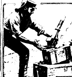
This remarkable machine weapon, which is being used with telling effect against the British in the trenches, is an Australian invention...