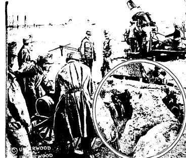
This is one of the Austrians which have been used with great effect against the Russian. Many soldiers are seen bringing a 100 pound shell about wooden tracks to be loaded into the gun. Below, at the right, is a view of Austrian trenches.