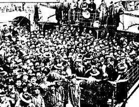
Part of the great problem of the United States is the feeding of the thousands of Indians who are being trained in the various branches of the military service.