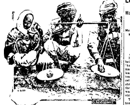
Part of the great problem of the United States is the feeding of the thousands of Indians who are being trained in the various branches of the military service.