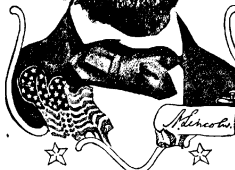
Portrait of a man, likely a historical figure, with a mustache and top hat.

It is for the living that the battle is fought, and it is to the living that the victory must be won.