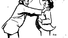
THE VILLAGE CONGRÉGATION WELCOMES THE GOOD JUICE