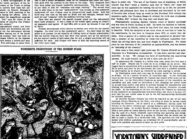
THE FINAL SCENE IN THE "CHANTECLER."