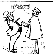
THE GOOD JUDGE AND THE GENERAL