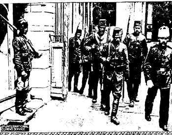
Head of the infantry of the Turkish army and one of the German officers who have been drilling the soldiers of the infantry for the last week.