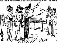
THEY WALKED UP THE PIER DAILY WITH THE YOUNG MAN TO SHOW HIM OFF.