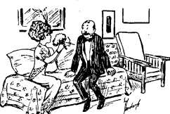
BROUGHT HER A BUNCH OF VIOLETS AND ASKED HER IF SHE READ MATERIALIZED.