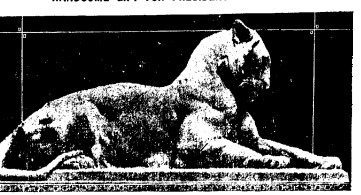
This immense gift, the finest ever made by A. P. Proctor, is to be presented to President Wilson by the President of the United States, and it is known as the gift of the President of the United States.