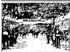
In the company of the megalithic ruins in the ancient city of Nara, Japan, an aged and venerable deer, the sacred deer of Nara, Japan, is seen in the company of a group of people. The deer is the symbol of the city and is worshipped as a deity. The preceding always attracts a large number of tourists.