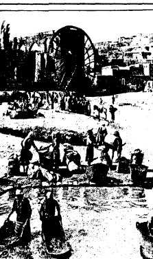
View, in northern Italy, is justly famous for its large water wheels.

"I will see to it," said the driver, as he drove to the residence of the girl's father. "I will see to it," said the driver, as he drove to the residence of the girl's father. "I will see to it," said the driver, as he drove to the residence of the girl's father.