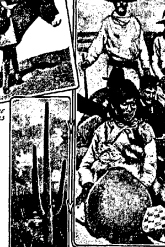
WOMEN WITH PEARL OYSTERS AND SHELLS

It is a well known fact that the women of the island are very fond of their native life. They are a very hardy and energetic race and are very fond of their native life. They are a very hardy and energetic race and are very fond of their native life.