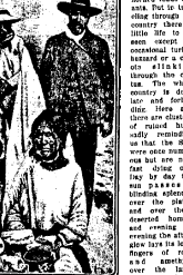
WOMEN WITH PEARL OYSTERS AND SHELLS

It is a well known fact that the women of the island are very fond of their native life. They are a very hardy and energetic race and are very fond of their native life. They are a very hardy and energetic race and are very fond of their native life.