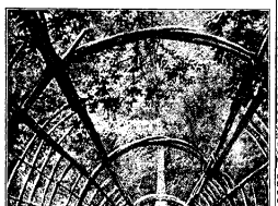
On the northeastern border of India are to be found some most strange and remarkable bridges, built by primitive peoples. One of the most important of which is here presented.

Novelty in Mill Papering A San Francisco, N. J., man has just completed the decoration of a room in his home by covering the walls with a group of pictures taken from newspaper in the past and representing the most ludicrous of events. He has been a newspaper since 1899 and collected the pictures for many years. The paper was carefully arranged in cases five or six inches deep, and the pictures were pasted on the wall. The pictures were arranged in a regular order, and the result was a most interesting and novel display. The pictures were taken from various newspapers, and the most interesting of them were those which showed the most ludicrous of events. The pictures were arranged in a regular order, and the result was a most interesting and novel display.