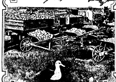
CHURKETONO THE POOL